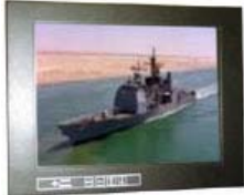
Wall / Arm Mount