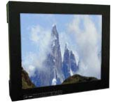
Wall / Arm Mount